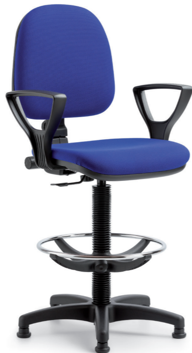
LEM OPERATIVE CHAIR