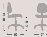
LM 10 Sedia dattilo ergonomica bassa senza braccioli mov. 10L. Low ergonomic typing chair without armrests mov. 10L.