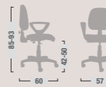
LM 11 Sedia dattilo ergonomica bassa con braccioli mov. 10L. Low ergonomic typing armchair mov. 10L.