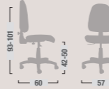
LM 14 Sedia dattilo ergonomica alta senza braccioli mov. 10L. High ergonomic typing chair without armrests mov. 10L.