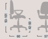
LM 13 Poltrona dattilo ergonomica con braccioli mov. 10L. Ergonomic typing armchair mov. 10L.