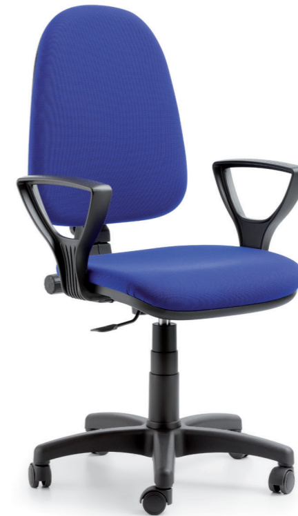
LEM OPERATIVE CHAIR