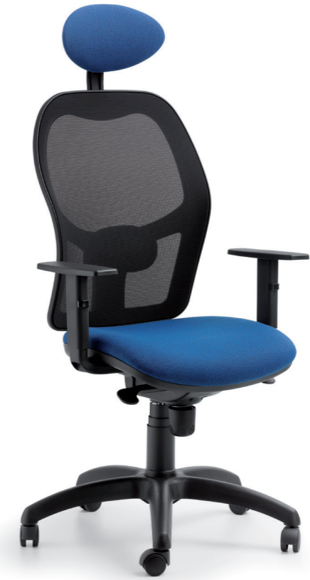
VEGAS OPERATIVE CHAIR